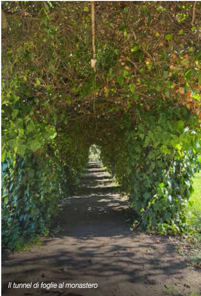
Il tunnel di foglie al monastero