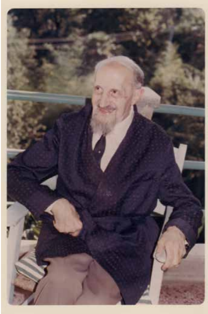
Roberto Assagioli Summer 1966 Capolona